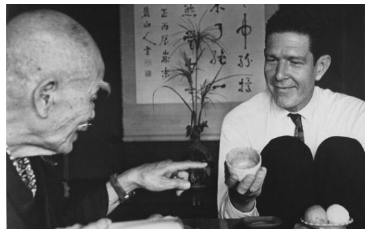
(John Cage and D.T. Suzuki in Japan, 1962)

John Cage saw art "not as a vehicle for self expression, but self alteration." He produced many works of both music and visual art inspired by the Zen philosophy. For Cage, space and emptiness (=Ma) - like the core theory of 'voidness' in Buddhist metaphysics - were precious material for artistic exploration. Ma; space, or silence, reverberates through his artwork and musical composition. At the time he attended the seminars by Dr. D.T. Suzuki at Columbia University, he was in a state of desperation. His personal life went through a big turmoil, divorcing his wife and starting a new relationship with a dancer Merce Cunningham. He was also coming to a conclusion that communication in art, the hallmark of an expressive musicality, was not possible. The lectures on Zen seemed salve to both the personal and artistic problems. Dr. D.T. Suzuki taught Cage something essential about breaking the bounds of western culture's most destructive paradigm; its toxic ultra-individualism and attachment to ego. The Zen-inspired call to attentiveness to the present, with its transparency