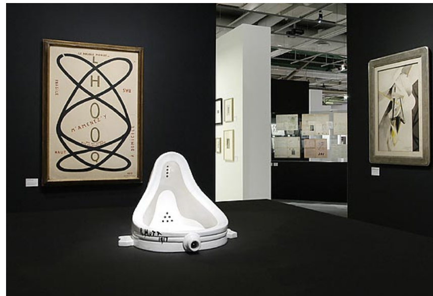
(Duchamp's "Fountain" in the "Dada" exhibition in Pompidou)

the taste of foods exists not in the chef or in the foods itself, but in the one who eats it (21).