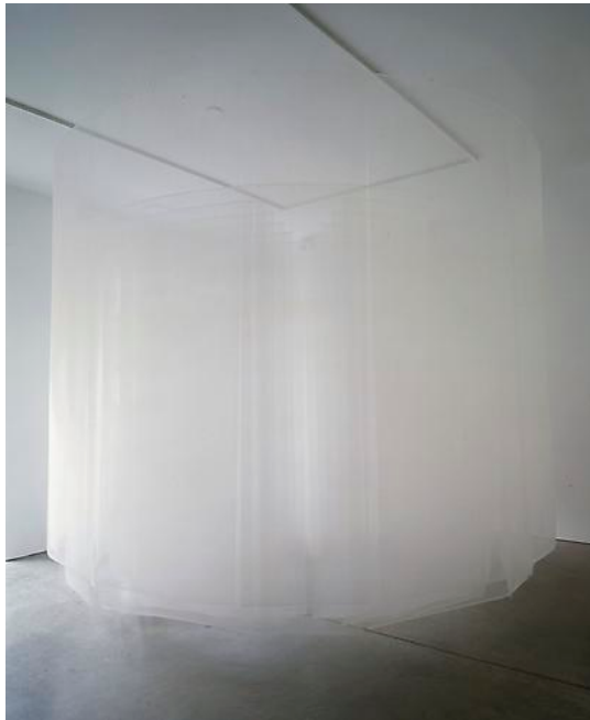
(One place on the earth, Rei Naito, installation, silk organza, 1991)

Naito's installation 'One Place on the Earth' consists of a 15 meters long and more than 5 meters wide tent-like construction of translucent white silk organza, seven layers, surrounding an enclosure, into which the audience enters one person at a time through a slit of the curtain