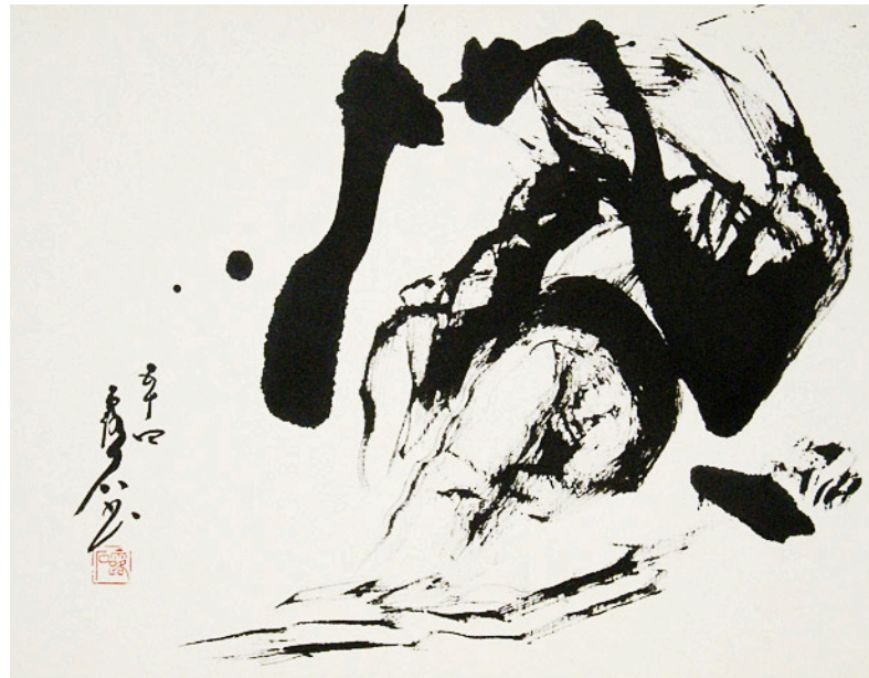
(Roseki Saito "Wind" 2010)

calligraphy invites at once a visible and tactile involvement, as well as imagination, both for the calligraphers and for viewers/readers.