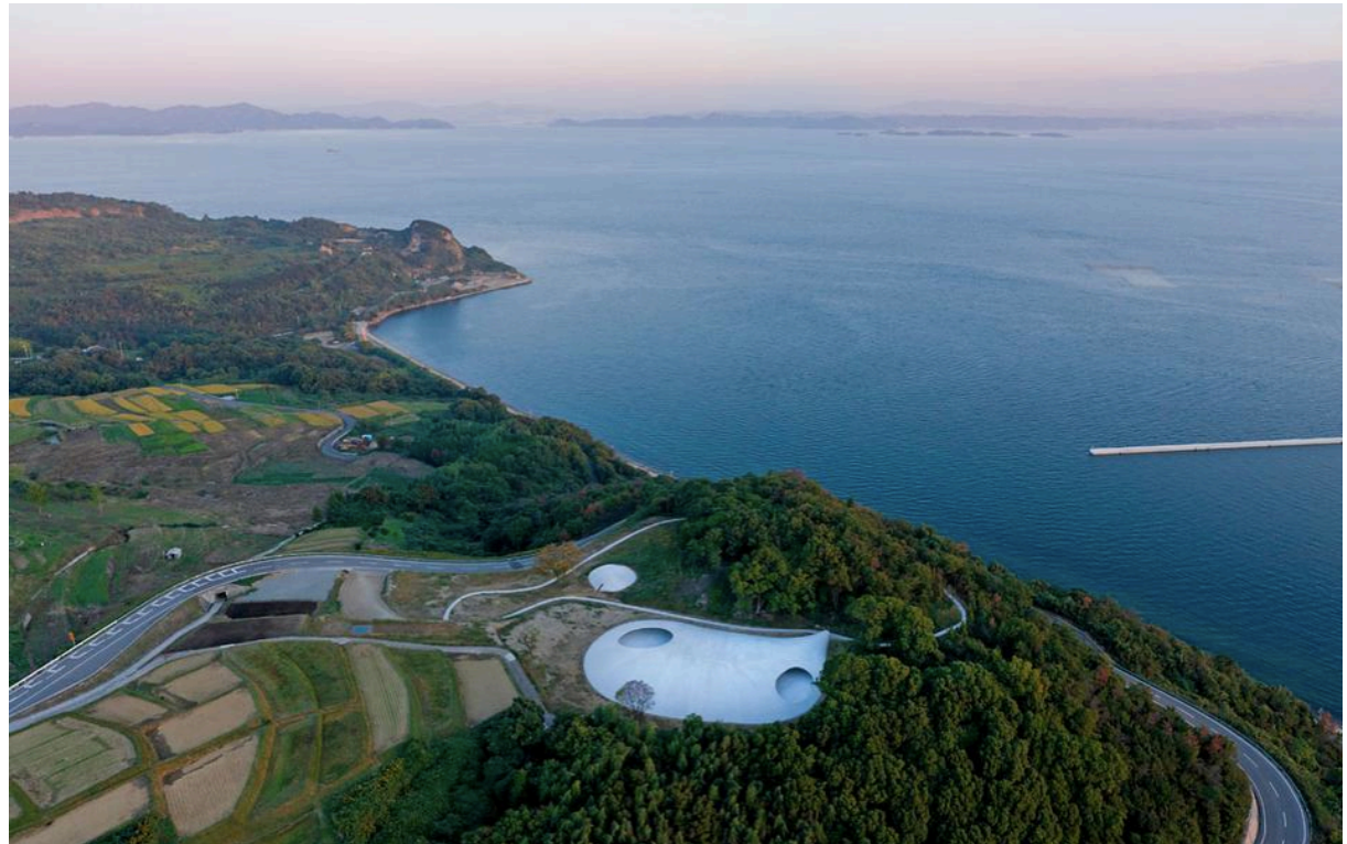
(Ryue Nishizawa, Teshima Art Museum, 2010)

The Teshima Art Museum and Matrix is a six year collaborative project between the architect Ryue Nishizawa and Rei Naito. The museum, entirely dedicated to Naito's Matrix, is made up of a single concrete pod structure with no pillars. The design resembles a droplet of water. And in the same way that rain interacts with the earth, the structure appears to blend and sink into its surrounding hills. It is in fact less a facility to house artworks than a gigantic art installation in its own light, set amid a breathtaking landscape of terraced rice paddies high above sea horizons.