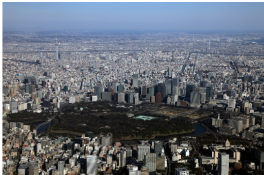
(View of the Imperial palace in Tokyo)

This concept of 'central empty core' is also embodied in the design and layout of the capital city of Japan; Tokyo. At the center of Tokyo's hustle and bustle is the Imperial Palace - an empty space of Ma, which served as a meditative and spiritual focus and anchor for the people of Tokyo.