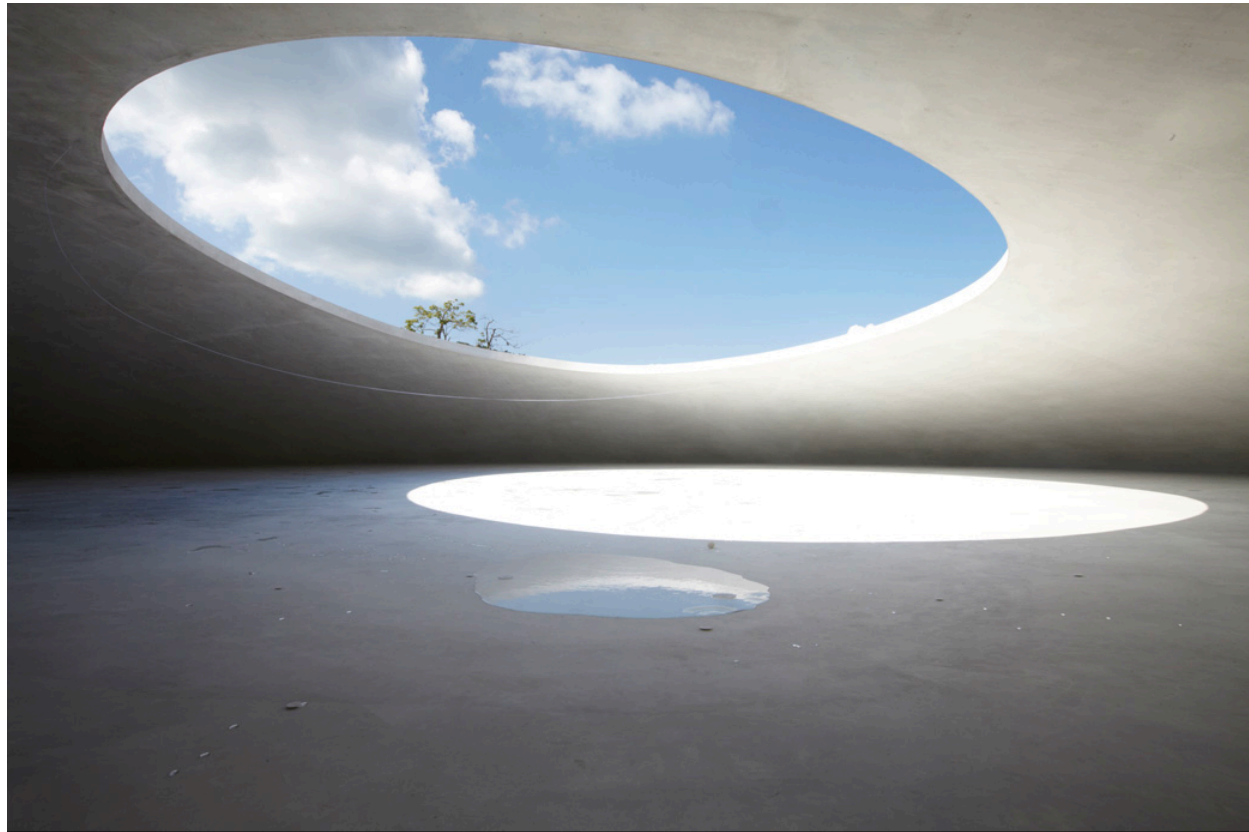
(Rei Naito, Matrix, 2010)

Added to this distillate of the real is a slice of pure magic. You soon notice that the randomly accumulating droplets of water dance across the floor, which gather and merge into larger pools under the apertures in the roof. This miniature landscape is in constant motion; glistening rivulets dart from place to place. These puddles and streams are fed by tiny springs: droplets of groundwater are beading out through the concrete floor. These little water droplets are formed from little microscopic holes in the concrete. Each droplet would then go on a very slow journey across the floor. Sometimes they would join with other drops, other times they would separate as they worked their way across the space in all directions, they would eventually make it to larger sink holes in the floor on a journey that might take hours to complete. When the drops reached these sink holes they would fall creating a loud gurgling sound as they disappear into the darkness below. The sound echoed around the space suddenly make you more acutely aware of all the sounds around you -