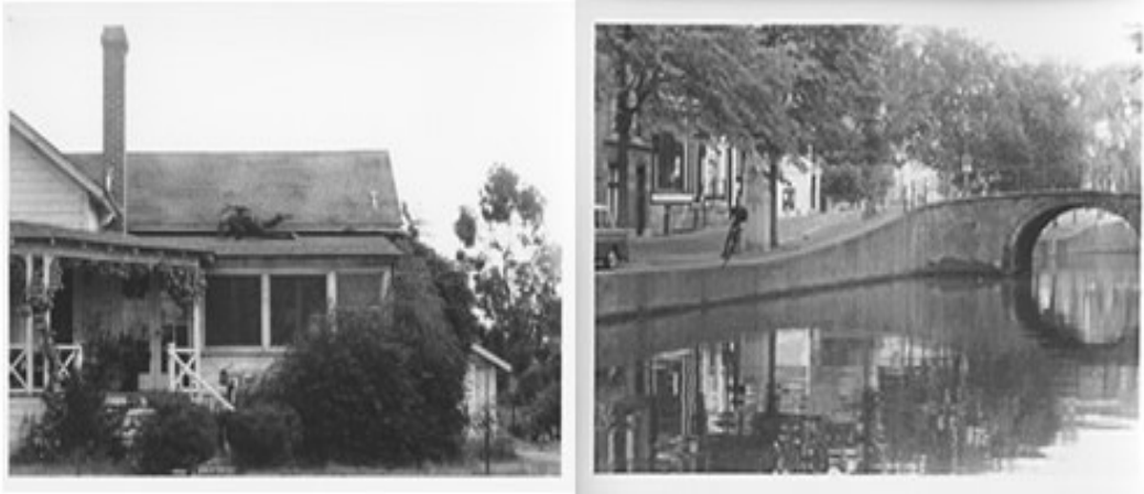
Bas Jan Ader, Fall I, Fall II (1970)

perfect it. There needs to be a point when one says, stop, its complete. The danger of over-working an object, is that there is a higher risk of damaging the piece when it is close to perfection.