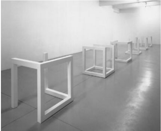
Sol Lewitt, Incomplete Cubes , 1974