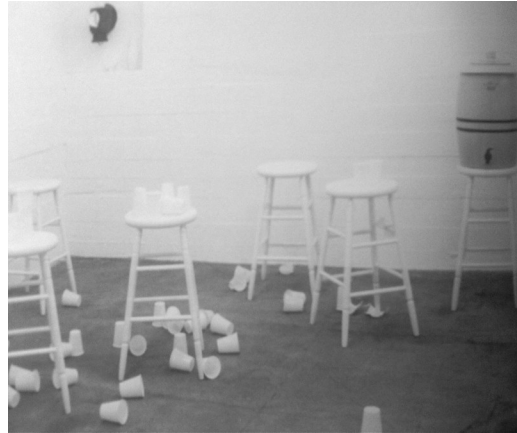
Rirkrit Tiravanija, detail of Untitled (Fountain) , 1994

the original plan, never allowing an accident to factor in, he or she may miss a valuable opportunity to discover a new way of making art.