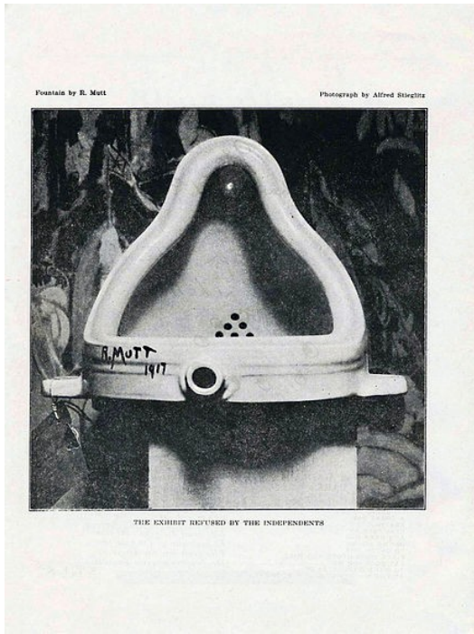
Marcel Duchamp, Fountain, 1917