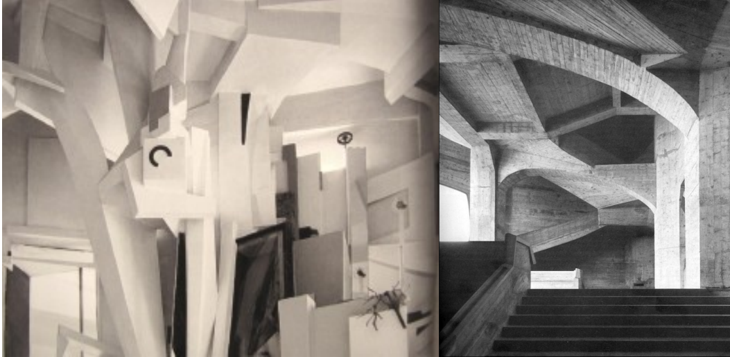
Kurt Schwitters, Hanover Merzbau, 1923-1936 / stairwell of Goetheanum II, 1924