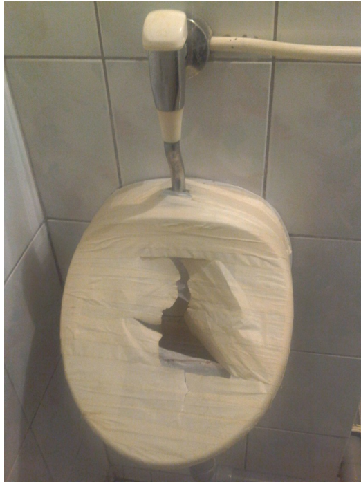
found urinal in a restaurant, Amsterdam, 2012

transference of context from one environment to the next, its title and final signing of an artistic name on the object in handwriting.