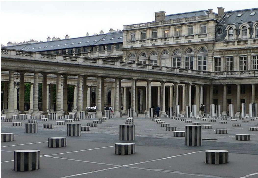
Daniel Buren, Les Deux Plateaux, 1986