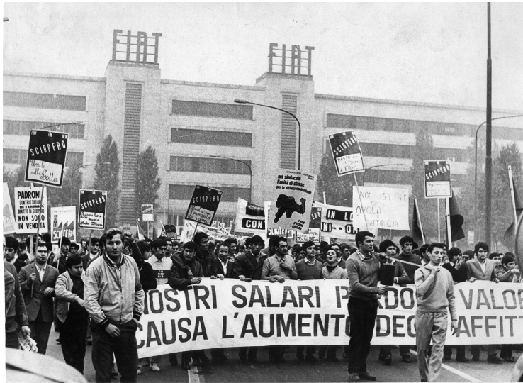
"Hot Autumn" strike, Italy, 1969